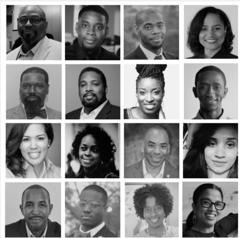
OUR 2018 NOMATLANTA BOARD

That was the beginning of the National Organization of Minority Architects, an increasing influential voice, promoting the quality and excellence of minority design professionals. There are NOMA Chapters in all parts of the country, increasing recognition on colleges and university campuses and providing greater access to government policy makers.